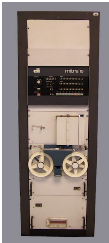
CII Mitra 15